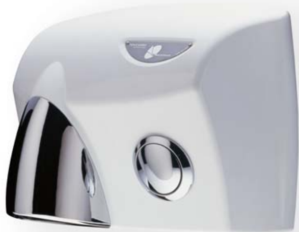
Touchdry with polished chrome nozzle and button TOUCHDRY-PC