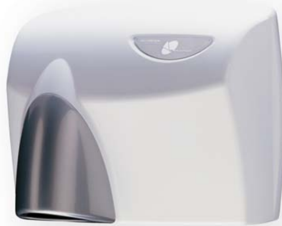
Autobeam with silver gloss nozzle AUTOBEAM