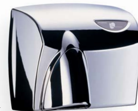
Autobeam with full chrome cover and nozzle AUTOBEAM-PCCH

overall design for commercial bathrooms.