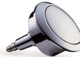
New and improved solid touch button

JD MacDonald Touchdry and Autobeam hand dryers are guaranteed against defective materials and faulty workmanship for 10 years from date of purchase, subject to being installed and maintained in accordance with the Installation and Operating Instructions supplied with the dryer.