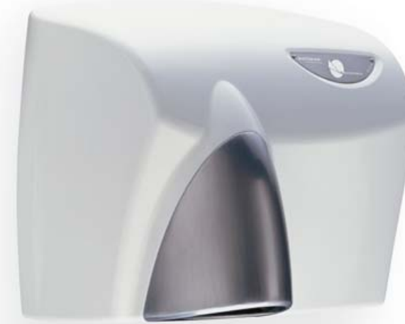
Autobeam with satin chrome nozzle AUTOBEAM-SC