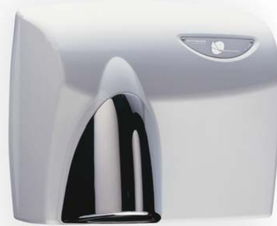
Autobeam with polished chrome nozzle AUTOBEAM-PC